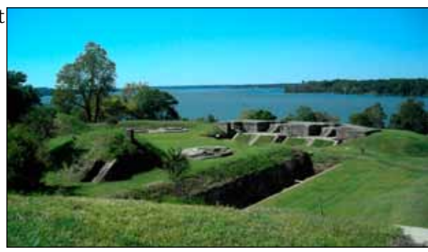
View of Fort Washington.

and 1920s, as well as the masonry fort itself. The structures were, and are, located both within and outside of the masonry fort. The NRHP nomination form for this property indicates that archeological deposits associated with a number of now-razed structures are likely present within the park (Nickels and Korzan 1985). Troops were stationed at Fort Washington during the Civil War, although the